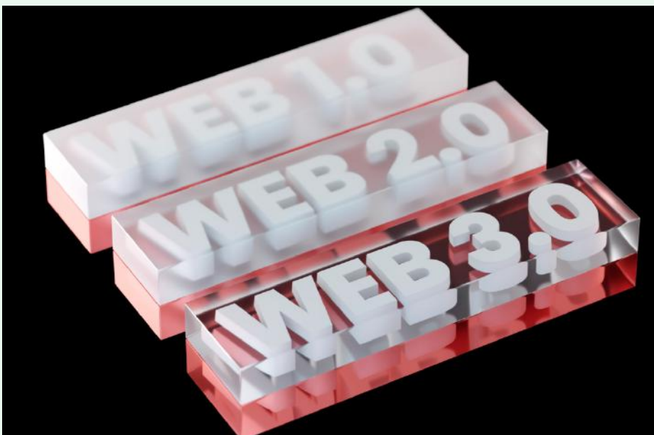
The web3 gaming industry is on the rise thanks to technological advances and consumer interest.

The web3 gaming industry is gaining momentum due to technological advancements and growing consumer interest. The IGF will play a pivotal role in shaping the future of gaming by supporting innovative projects and fostering collaboration within the ecosystem. Immutable, Polygon Labs and King River Capital are leading the way into a new era of decentralized and consumer-led gaming.