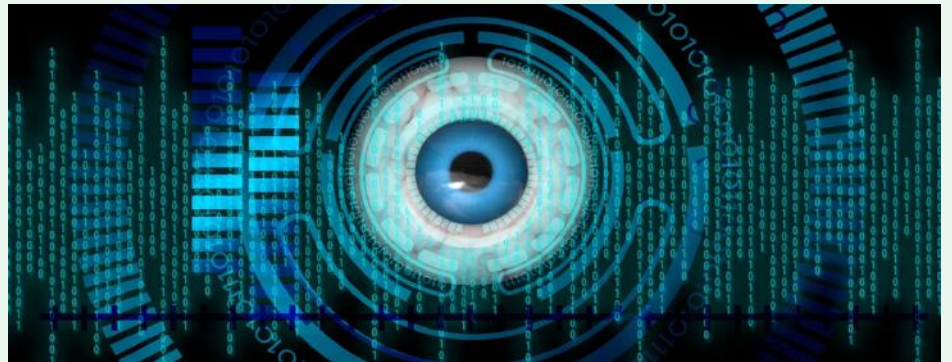
Worldcoin, is a pioneering project combining digital identity and cryptocurrency

At its core, the Worldcoin story is not just about a tech startup navigating the complex world of global regulations. It's a story of resilience, innovation and an unwavering commitment to marrying the future of identity with the bedrock of legality and ethical practice. As it moves forward, Worldcoin remains a beacon for how ambitious projects can navigate the tricky waters of innovation in a regulated world, striving to bring its vision of a secure, accessible digital economy to every corner of the globe.