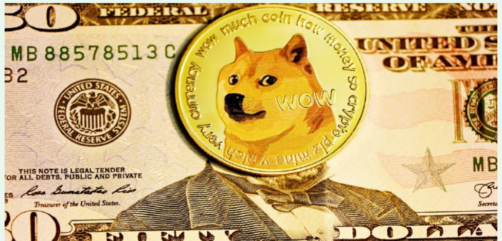
Coinbase aims to provide investors with a wide range of investment opportunities

Under regulatory guidelines, Coinbase intends to utilize the "self-certification" method to expedite the launch of futures contracts, bypassing the need for official approval from the CFTC. The decision to include Dogecoin, Litecoin, and Bitcoin Cash in its futures trading platform is seen as a strategic maneuver by Coinbase to diversify its offerings and attract a broader investor base. By expanding its suite of trading pairs, Coinbase aims to provide investors with a wide range of investment opportunities backed by ample liquidity.