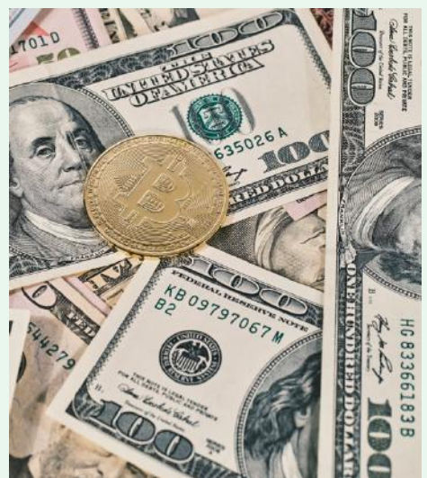
An impressive total of 214,246 Bitcoins are held by MicroStrategy

MicroStrategy's bullish stance on Bitcoin has been well-documented since its initial foray into the cryptocurrency market in 2020. Since then, the company has continued to double down on its Bitcoin investment strategy, leveraging debt offerings to finance additional purchases of the digital asset.