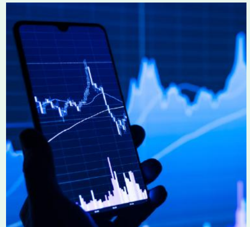
Findings highlight increasing institutional interest and investment in cryptocurrencies

Bernstein's analysis suggests that the recent price pullback presents a buying opportunity ahead of bitcoin's next halving event. The firm remains bullish on Bitcoin and the broader crypto eco-system, forecasting that the total crypto market cap will triple to $7.5 trillion by the end of 2025. Bernstein's findings highlight increasing institutional interest and investment in cryptocurrencies, indicating significant potential for growth and innovation in the sector in the coming years.