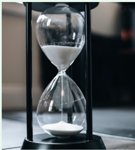
The countdown to the Bitcoin halving approaches its final stage

Moreover, the activity in the Ordinals field is boosting miners' income by increasing