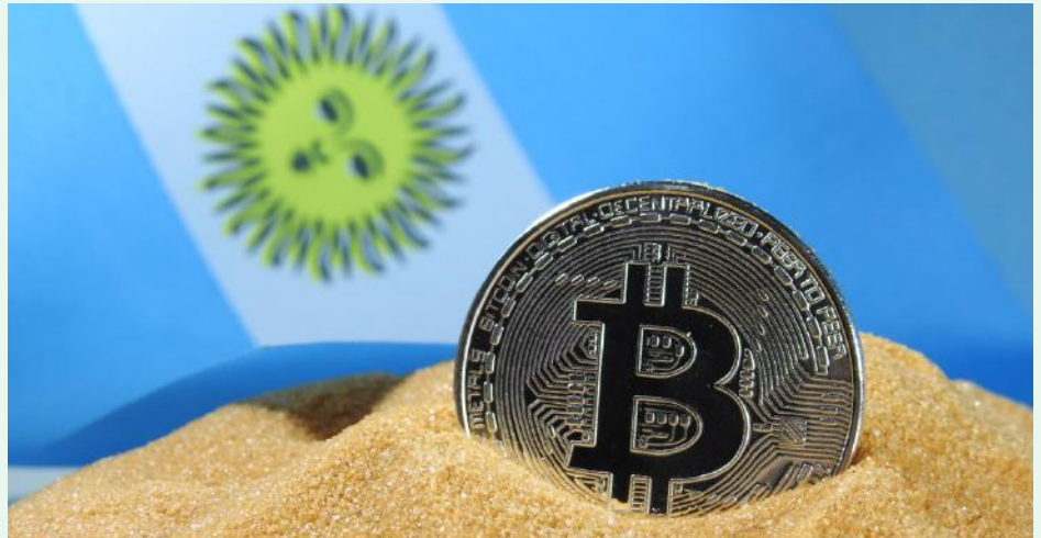
Argentina made a big move in the cryptocurrency world by passing an anti-money laundering law

Looking ahead, the challenge for Argentine policymakers will be to continue to support the growth and innovation of cryptocurrencies, while putting in place safeguards against potential problems. This recent legislation is an important step in Argentina's journey with digital assets, signaling a strong commitment to a transparent, safe and regulated cryptocurrency market.